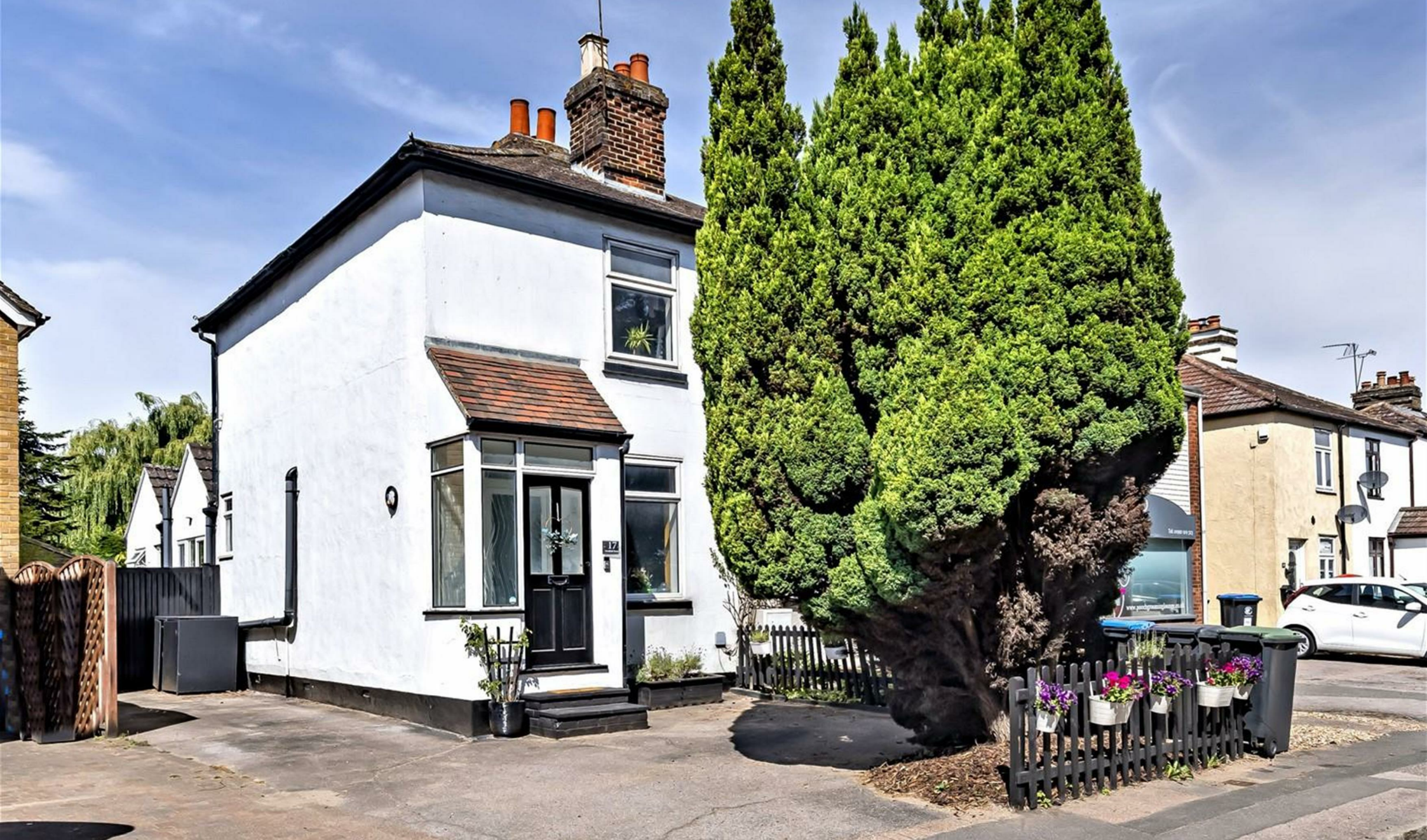
Woodfield Terrace, Thornwood Guide Price £465,000